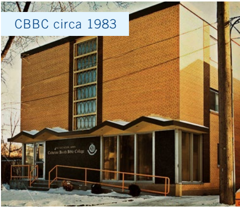
CBBC circa 1983